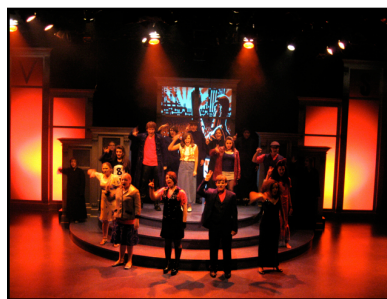
Photo from Superpowerless - Lovewell Dayton 2009

We are diligently working on solidifying the dates for our 2010 workshops. Everything should be in place by the 25th of September. Please look for an e-mail announcing the on line applications being released as well as a $100.00 early bird sign up initiative for returning students!