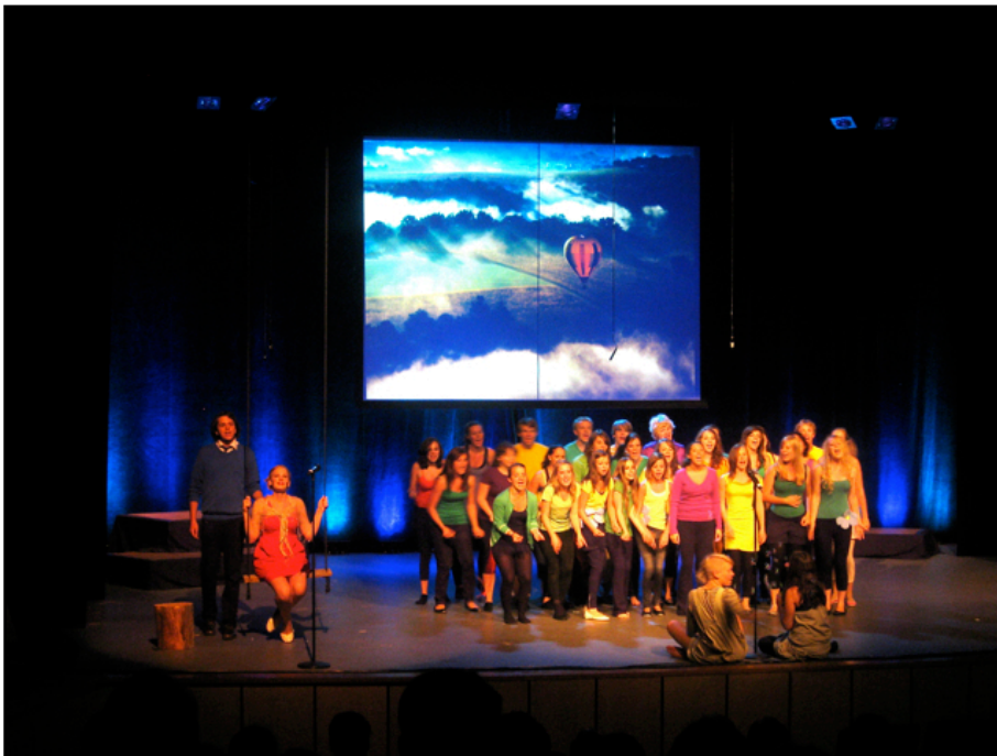
Photo from Forget-Me-Not - Lovewell Sweden 2009

From May to August we ran nine workshops around the world, worked with over 200 students, employed 35 staff artists and some 3,000 people saw one of our shows. The summer of 2009 made Lovewell history. Thank you all so much for being a part of it.