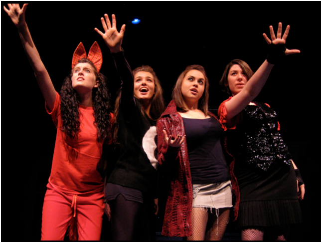
Photo from Superpowerless - Lovewell Dayton 2009

The applications for our 2010 Lauderdale and Sweden workshops are now available at www.lovevell.org under the apply link. If you are a returning student and you apply before November 1st, 2009, you will receive a $100.00 early bird discount on your tuition. Please note that all of our programs fill to the brim!